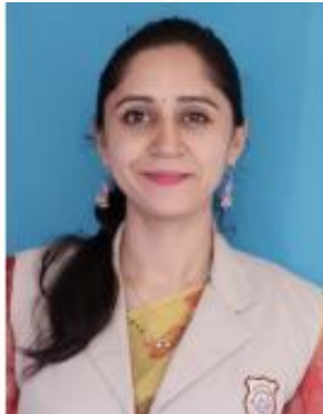
CHAITHRA B IV A CLASS TEACHER