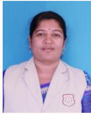
HEMAVATHI B VI C CLASS TEACHER